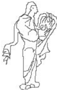
Utrecht Psalter lyre player, 9th cen. Standing, large teardrop shaped lyre with slightly concave sides, strings too faint to count. Seems to float on left side of body. Left hand barely visible (faded in original MS) in hand-hole, right hand in front. Right hand shows thumb and forefinger arched as if to grab an interval; left hand seems to show something similar. Two pairs of lines on the top cross-bar are very clear - maybe a strap for the left hand? (The lyre seems to be set too low to be braced against waist or hip.)