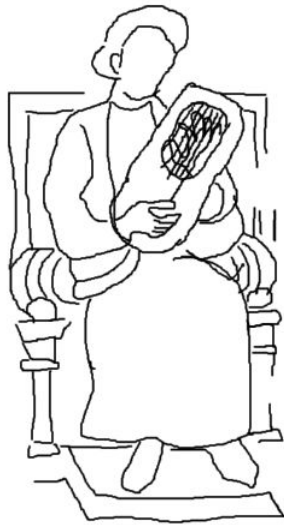
Vespasian Psalter David, early 8th cen. Seated, small oval 6-string lyre with straight sides held in lap facing front, resting on right leg and tilted toward left shoulder. Left hand blocking, right hand strumming. No straps visible.