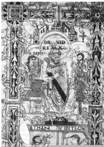
King David and musicians, from the Winchcombe Psalter (11th cen). David plays a triangular harp, but the musician on the right has a lyre. As in the Utrecht psalter, there's something on top of the lyre - maybe the fingers of a gripping hand?